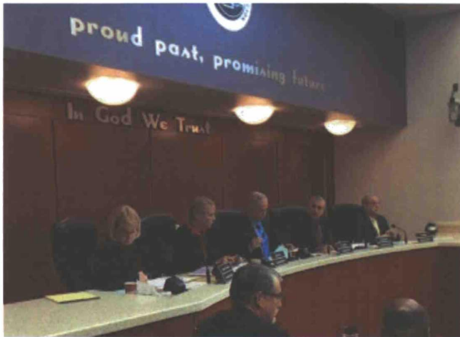
( http://www.columbian.com/wp-content/uploads/2016/02/council.jpg )